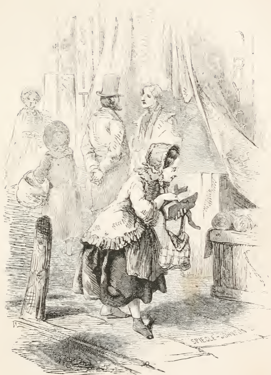
“She examined the book carefully.”—Page 154.